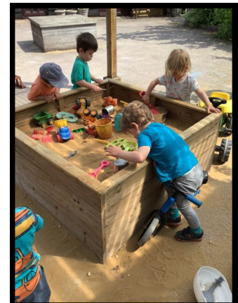
Lots of fun digging in the sand.