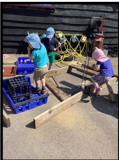
Using our imaginations to be creative.