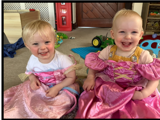
Having fun dressing up!