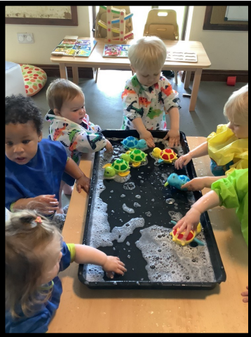
Tiny Tim sensory tray.