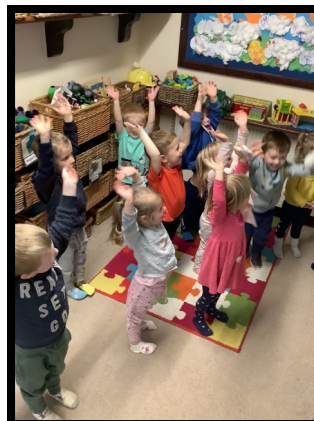
Cosmic Yoga time!