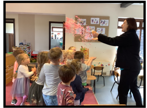
Celebrating our magic moments in Big Squirrels