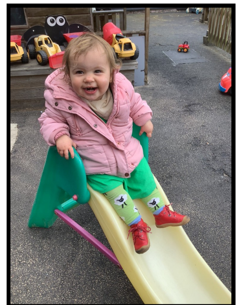
Ready, steady, go!