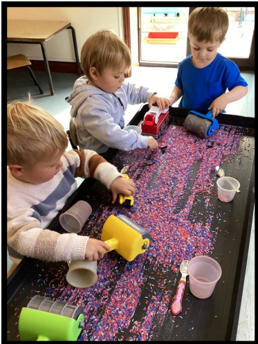
Exploring the Rainbow Rice.