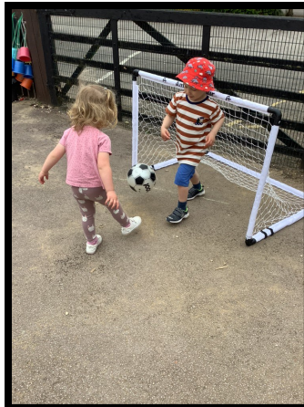
Playing football together.