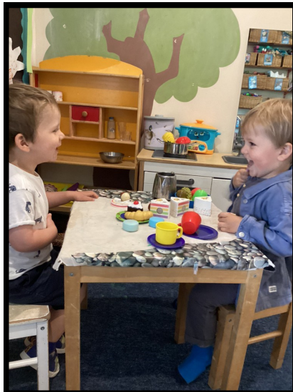
Enjoying tea for two!