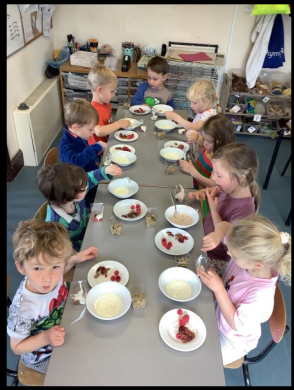
Making Yummy Yoghurt Parfaits