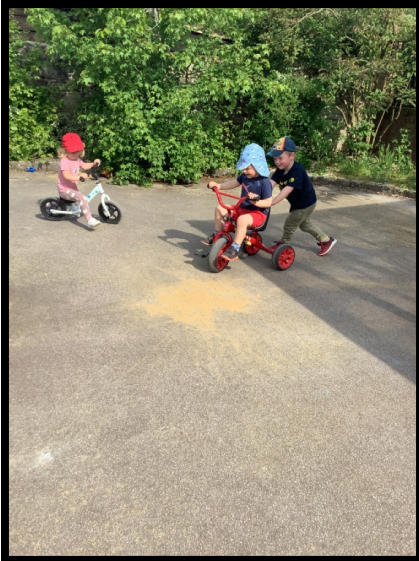
Giving my friends a little help.