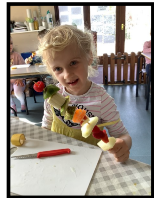
Making fruit kebabs