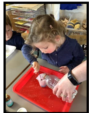
Making vinegar volcanoes