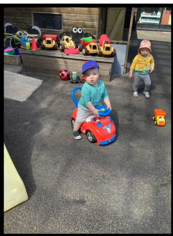
Enjoying the scoot along toys.