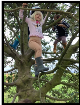
Enjoying climbing high in the tree