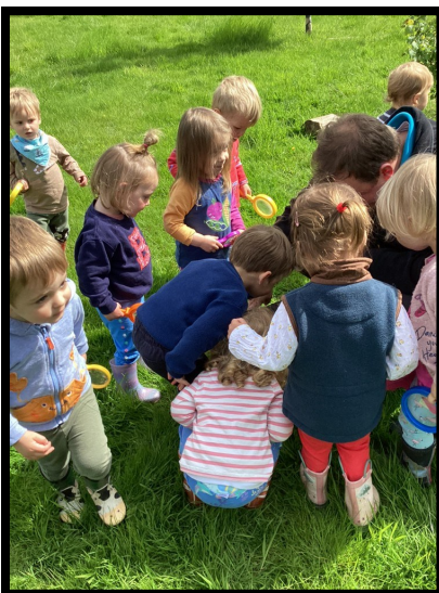
Looking for Bugs in the Meadow.