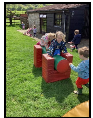
Soft Play fun in the sun!