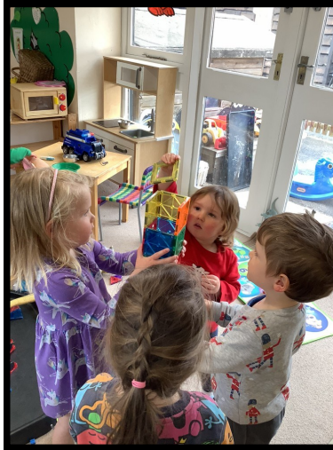
Building structures together.