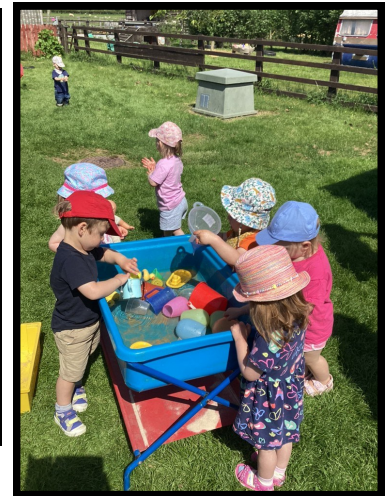
Water tray fun in the garden.