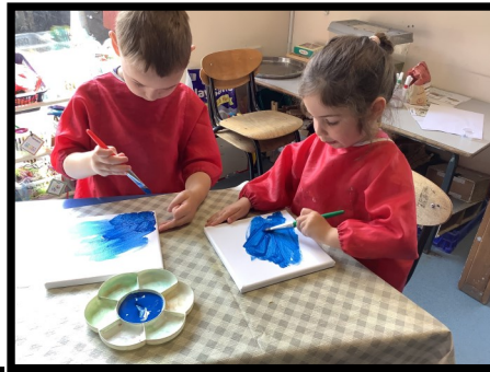
Recreating Van Gogh's Starry night on Canvass-