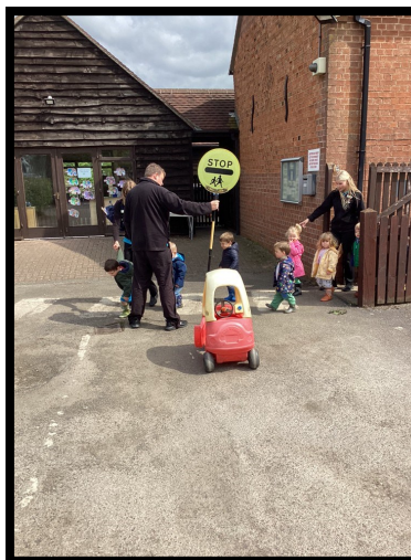
Road Safety Week.