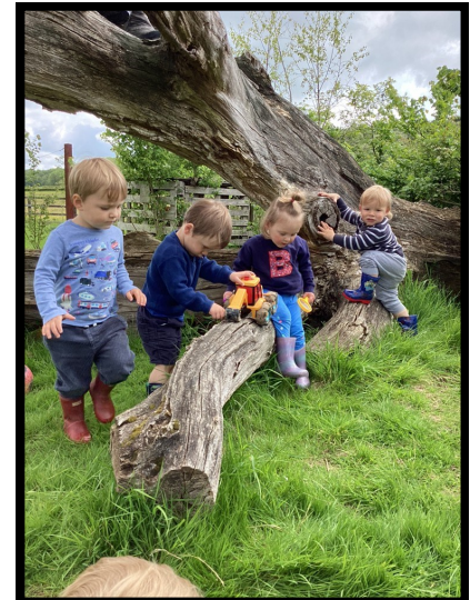
Fun on the Climbing Tree together.