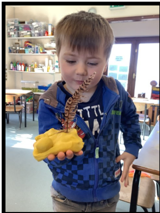
Just look at what I have made!!!