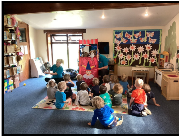
Puppet Show time.