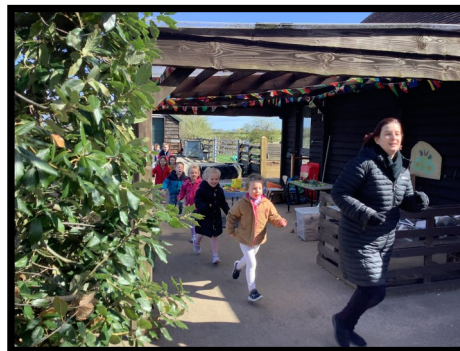
Jogging around the Nursery