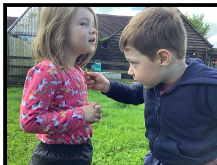
Looking to see if our friends like butter