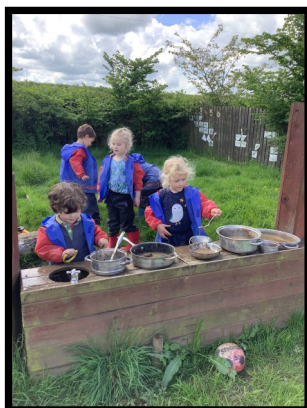
Having fun in the mud