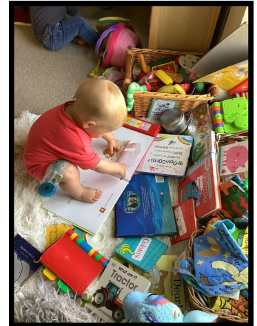
Exploring the flip flap books..