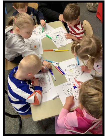
Creating Elmer pictures.