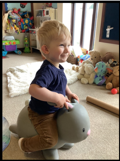
Hop little bunny, hop, hop, hop!