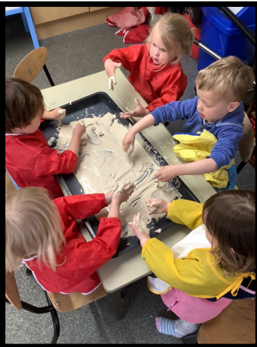
Exploring the sensory tray together.